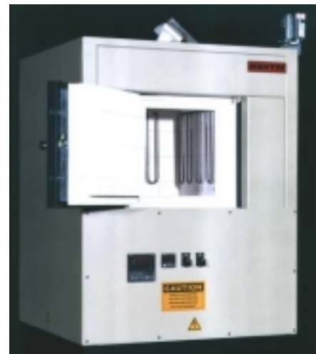
Model KSK-12 with optional automated exhaust port