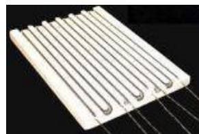
Wire Element Plate