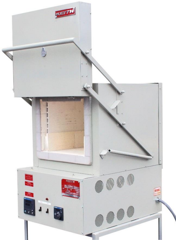
K-121220-B shown with over temp controller, embedded ceramic heating elements, viewing port - mounted on furnace stand

Keith Bench Top Hardening Furnaces are designed for general use in the shop, laboratory, factory or school and are ideal in the manufacture and testing of metals, ceramics, glass and electronics. By bringing heat treating in-house, you can save time and money while controlling quality and avoiding minimum lot charges.