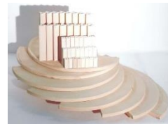
Furnace & Kiln Furniture