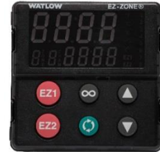
Watlow PID Controller