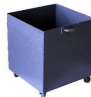
Roll away quench tank