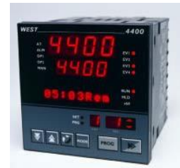
West 4400 Controller