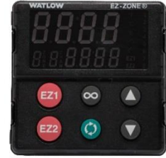
Watlow PID Controller