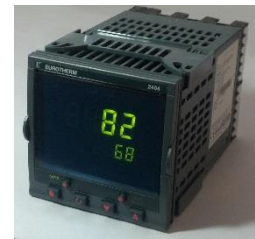
Eurotherm 2404 Controller