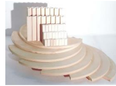
Furnace & Kiln Furniture