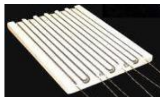
Wire Element Plate