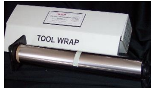
Stainless steel tool wrap