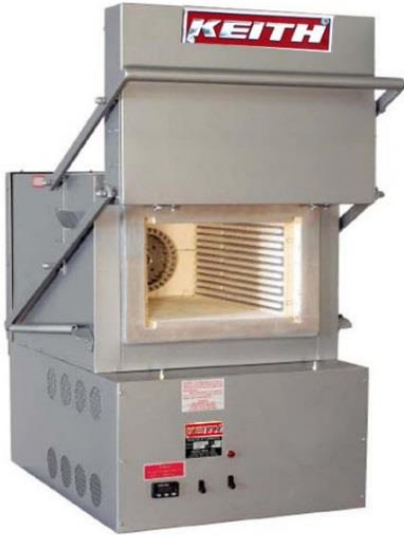
K-120820-DW shown with PM3E PID temperature controller, ceramic heating elements & fan

The Keith Standard 1250F Rated Bench Top Tempering Furnace has become the industry standard for general use in the shop, laboratory or factory where temperatures between 300°F – 1250°F ±10°F are required. These furnaces are alternatively called table top annealing furnaces, single chamber drawing furnaces, stress relieving furnaces and forced convection ovens.